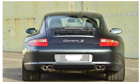
996 Carrera 1998 – 2001