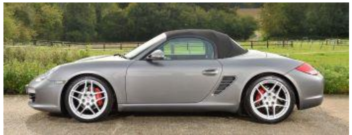
Boxster S 2002 - 2004