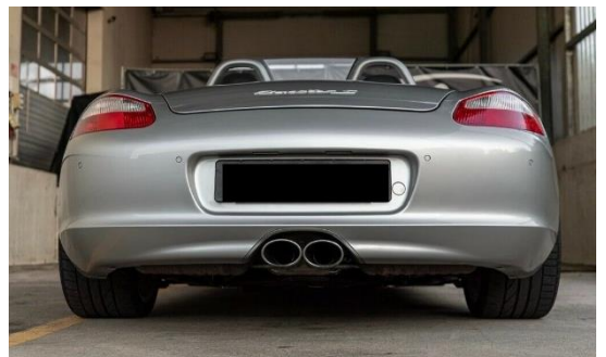
Boxster S 2009-2012 Gen 2