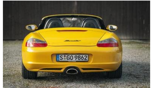
Boxster S 1997 – 2001