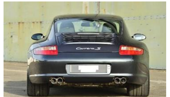
996 Carrera 1998 - 2001