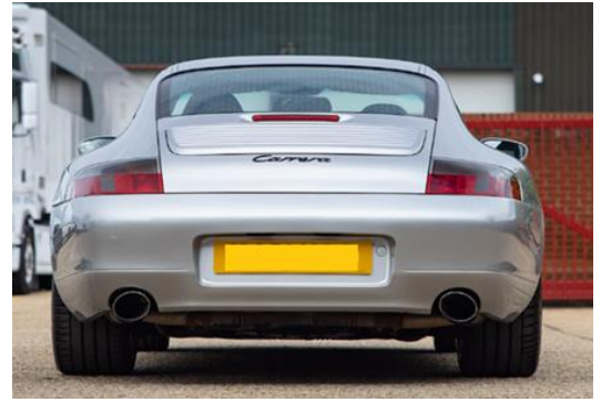
996 Carrera 2002 – 2004