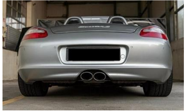
Boxster S 2009-2012 Gen 2