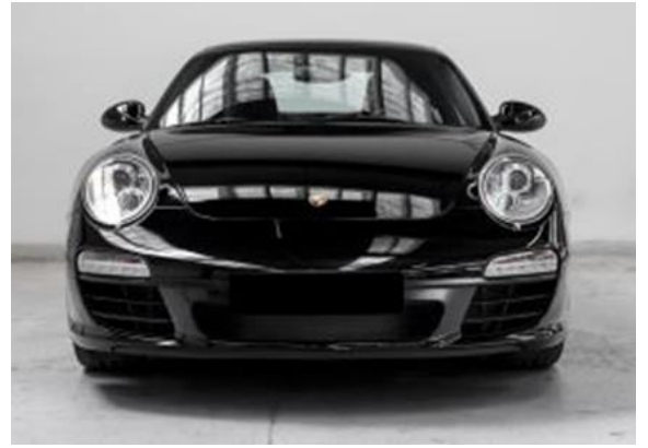
997 Carrera S 2004 - 2008