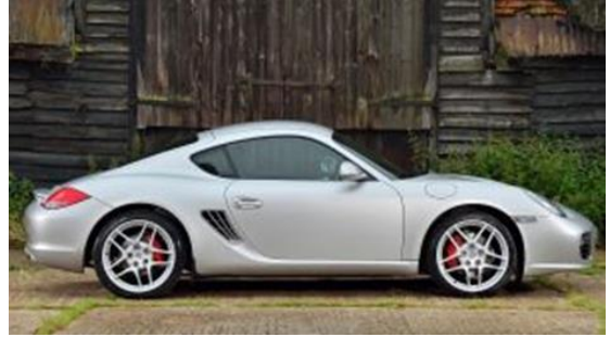
Cayman S 2005 – 2008