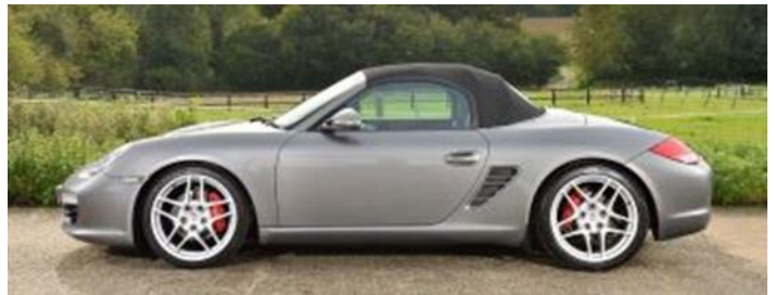
Boxster S 2002 - 2004