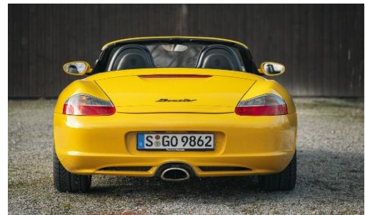
Boxster S 1997 - 2001