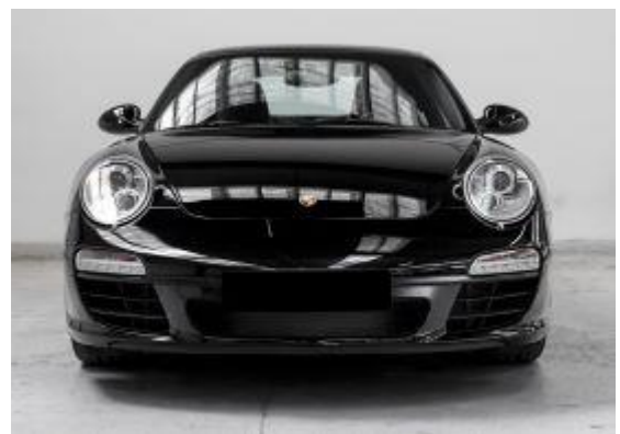
997 Carrera S 2004 - 2008