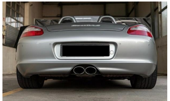
Boxster S 2009-2012 Gen 2