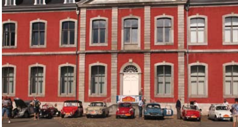
18:00-19:00 Rally Finish, Abbée de Stavelot: Spa Circuit Museum visit 21:00 Prizegiving dinner and overnight, Ramada Plaza Hotel, Liège Monday July 18 Breakfast; departure.