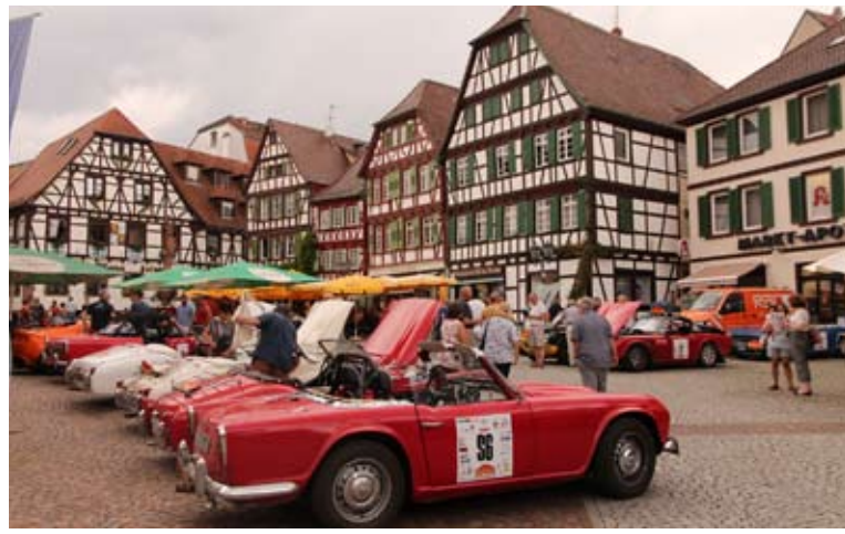
Sunday July 17 08:30-09:00 Check Out, Krone Hotel Circuit test, Rhine Ferry, German forests, Belgium